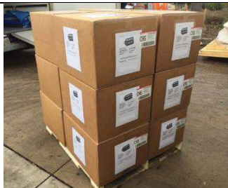
Similar sized boxes stack together neatly on the pallet.