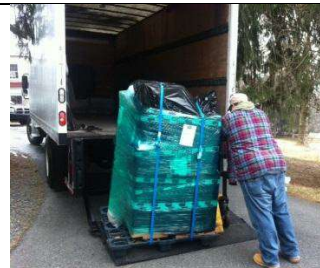
A tail lift truck & pallet jack is used to collect.