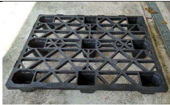
A plastic or wooden pallet is fine: measure 48x40 inches for a base.

On the collection date, we send a truck with a tail lift and pallet jack to collect your palletized shipment from your curbside, driveway, or garage off the street. Pallet needs to be on a hard, flat, level surface. Refer to collection instructions sent by your coordinator.